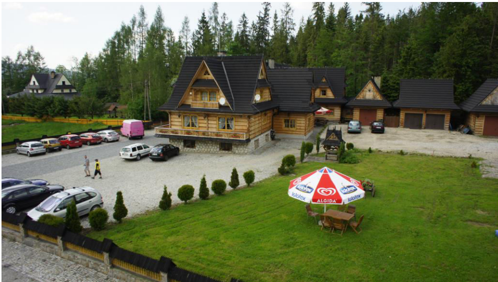
Gazdówka pod lasem

The conference PAEE-12 will be held in the guest house “Gazdówka pod lasem” in Kościelisko (near Zakopane) at the foot of Polish Tatra mountains. Participants will be located in “Gazdówka pod lasem” as well as in two directly adjacent areas – bungalows at “Kirowy gościniec” (6 Groń str.) and “Kirowa osada” (8 Groń str.)